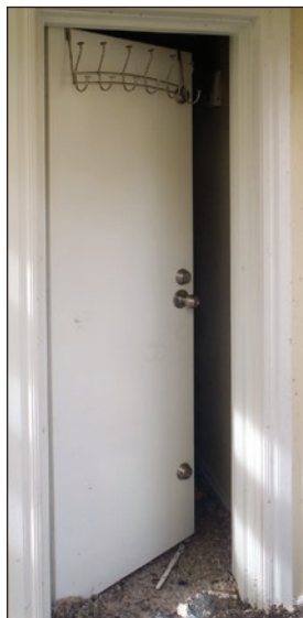
Residential safe room door (Moore, OK, 2013)

Steel doors commonly used in residential and commercial construction cannot withstand the impact of the wind-borne debris, or "missiles," that a tornado can propel, and their failure has resulted in serious injury and even death during