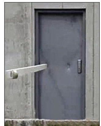
Tornado safe room impact test results: Door assembly passed; no perforation or latch/lock failure