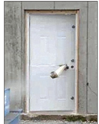
Tornado safe room impact test results: Door assembly failed when perforated