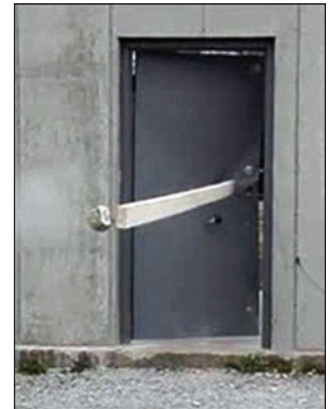
Tornado safe room impact test results: Door assembly failed at latch/lock