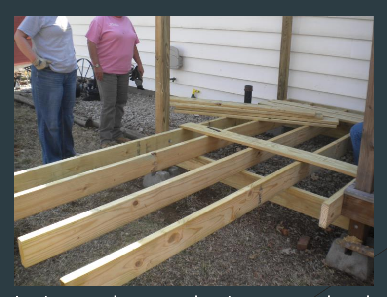
Laying out the ramp that is connected to the deck