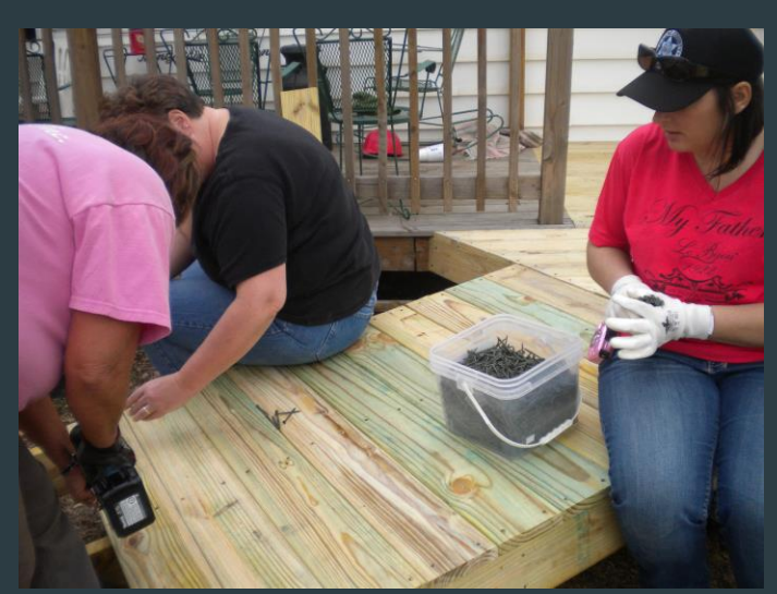
Screwing in 1 x 4's to the Ramp