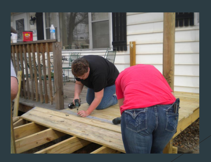
Screwing in 1 x 4's to the deck