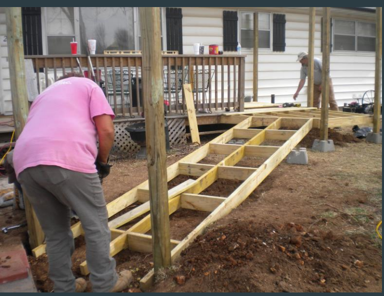
Digging holes as deep as 12"