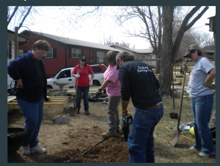
The team struggles cutting out the roots that are the size of basketballs