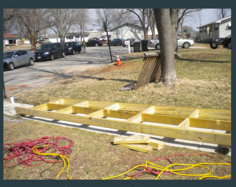
Constructing the ramp